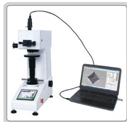
camera and measuring software (optional)

input the indentation diagonal lengths, the hardness value is shown on screen automatically